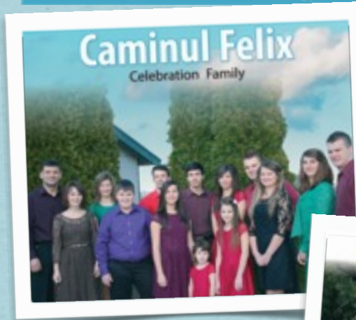
A wonderful group of a family from Romania Felix Family Villages represents the Felix Village in Thailand, traveling to Sweden. They come with strong, open stories about life from despair on the streets to a loving family. Come and take a listen, see and be touched.